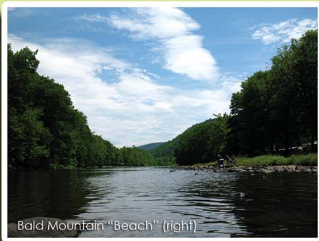
Bald Mountain "Beach" (right)

Bald Mountain has been family-owned and operated for over 40 years, and we take pride in operating a clean, quiet, and friendly campground. Our amenities include restrooms, showers, dump station, laundromat, playground, volleyball, basketball, ping pong, horseshoes, picnic tables, and fireplaces.